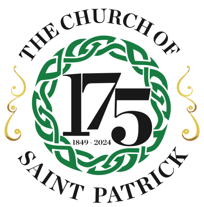
BROOKLYN • NEW YORK

KNIGHTS OF COLUMBUS (Msgr. Parks Center) 1st Tuesday of the Month at 7:00 PM